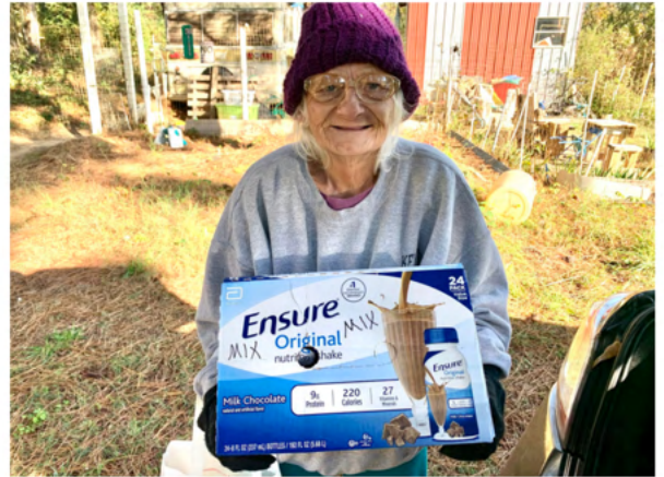
Pictured: Local resident who benefited from one of the grants awarded.

United Way of Marshall County created the Community Crisis Relief Fund to help increase access to basic needs for struggling individuals and families and our most vulnerable community members in response to the COVID-19 crisis. The fund focuses on providing assistance to food pantries and feeding programs, emergency assistance programs (utilities, rent/mortgage assistance and other vital basic needs), distressed nonprofit agencies in our area as well as other target areas in our community as assessed.