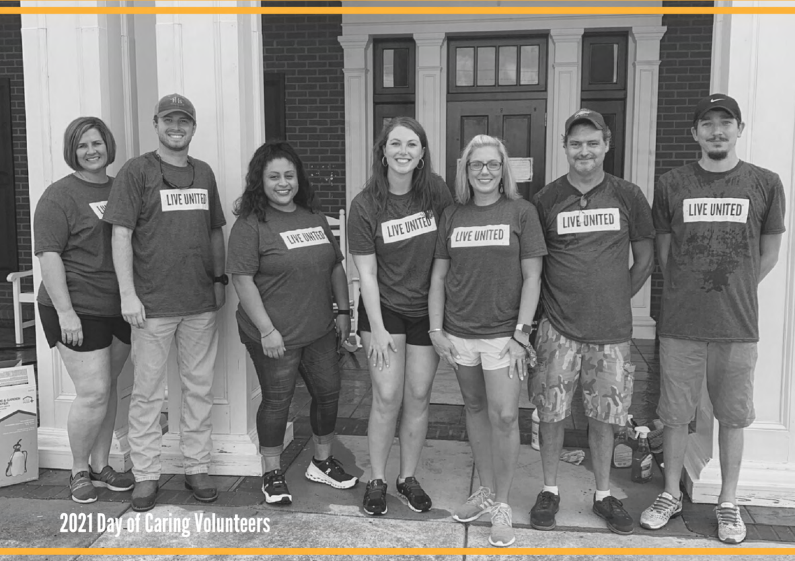
2021 Day of Caring Volunteers

UNITED WAY OF MARSHALL COUNTY 709 Blount Avenue Guntersville, AL 35976 Phone: (256) 582-4700 Fax: (256) 582-4779